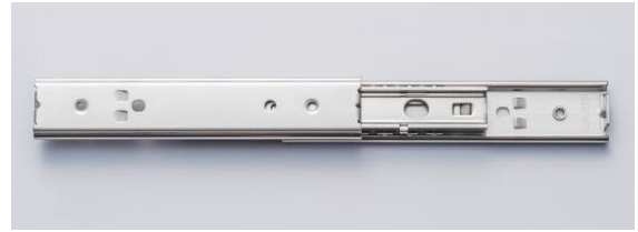
B type shown